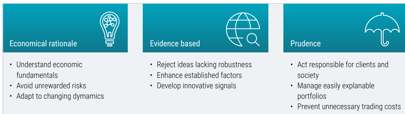
Figure 2: Investment beliefs Robeco's quantitative investment strategies

The first approach is linked to our investment belief on prudent investing, to lower, possibly unrewarded, long-term sustainability risks. Financially material ESG factors are integrated in the portfolio construction to ensure the ESG score of the portfolio is better than that of the index. In addition, the environmental footprints of the fund are made lower than that of the benchmark by restricting the GHG emissions, water use and waste generation. With these portfolio construction rules, stocks issued by companies with better ESG scores or environmental footprints are more likely to be included in the portfolio while stocks issued by companies with worse ESG scores or environmental footprints are more likely to be divested from the portfolio.